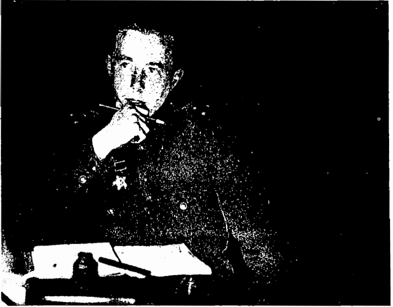
Aleksandr Isayevich Solzhenitsyn—in the army